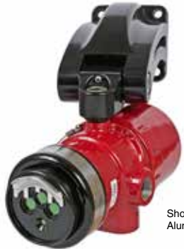
Shown with Q9033A Aluminum Swivel Mount